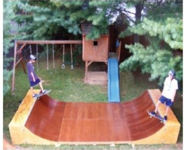
Half Pipe/Skate Ramp Rental - 18' L x 8' W x 2' 6" H

Bring the skate park right to your house